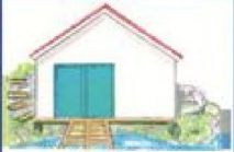
6. BOAT HOUSE