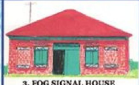
3. FOG SIGNAL HOUSE