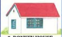
5. DONKEY HOUSE