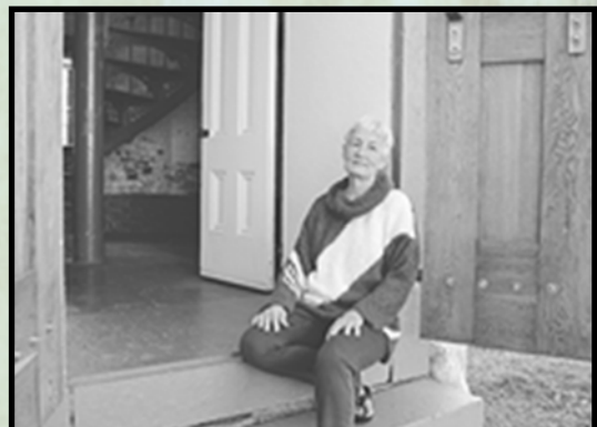
Halcyon at Seguin Light tower entrance—2012

In the spirit of sharing our little corner of the world we've done something different this year. As we created our annual Halcyon Yarn catalog we partnered with one of our favorite local organizations, the Friends of Seguin Island Light Station or FOSILS. Located a mere fifteen miles from Halcyon Yarn, the journey to Seguin Island can feel like traveling to another world ... A place where land is in sight, but time is marked by the change of tides and light, where even the air feels different... continued on page 7