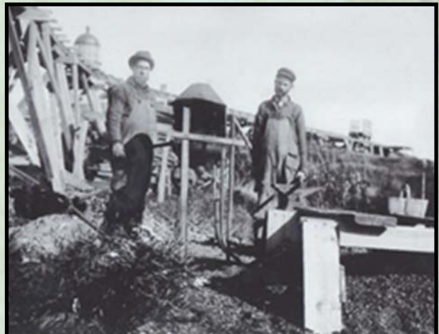
Tram workers 1895